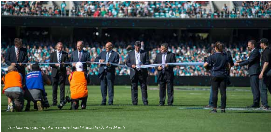
The historic opening of the redeveloped Adelaide Oval in March