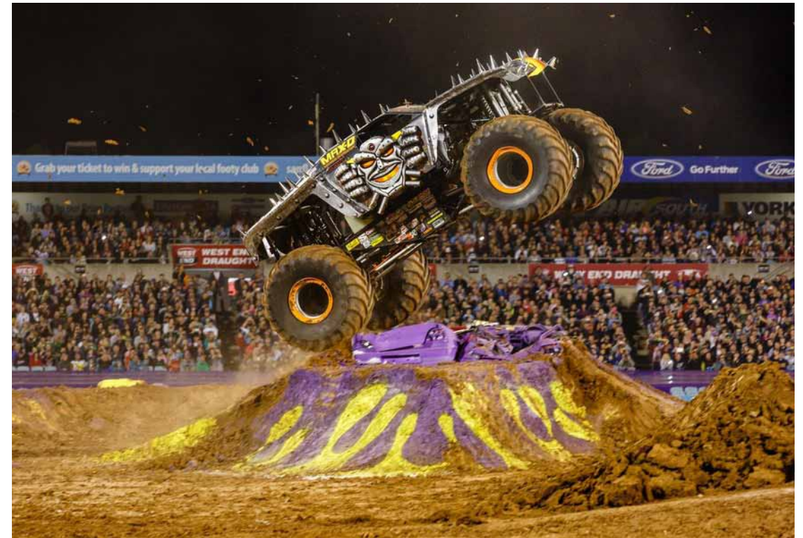
Monster Truck Max -D in action at AAMI Stadium

It proved to be a challenging year for the Encore Group and its staff as the SANFL's catering arm continued to undergo significant change.