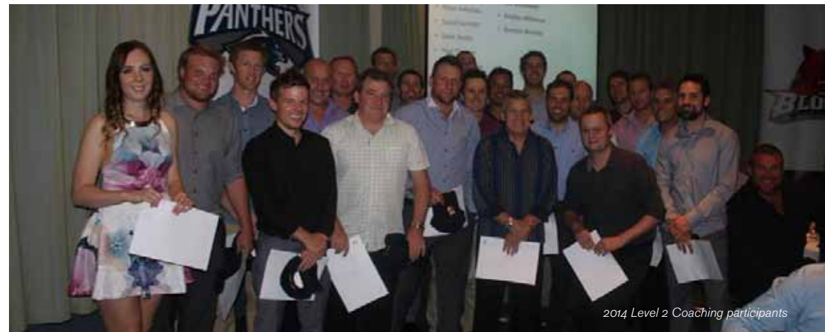
2014 Level 2 Coaching participants

The Under-17 Youth Championships help SANFL clubs identify players with the capacity to play consistently at Under-18, Reserves or League level in the future. Each League club's regional promotional zone was represented by a squad for the Championships which were held in July. Teams were divided into two divisions, with Woodville-West Torrens winning Division One and North Adelaide victorious in Division Two.