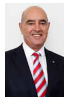
THE HON. JOHN OLSEN AO

SA Football Executive Commissioner and SANFL General Manager