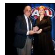
Photo: Hall of Fame recipients pictured receiving their awards from Liberal Senator from NSW, Senator Marise Payne.